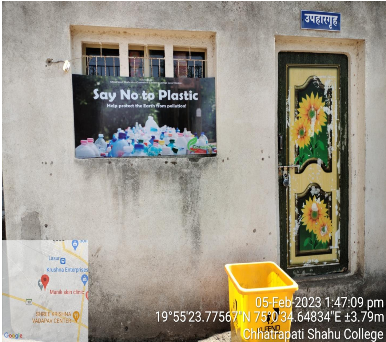
Dustbin & Plastic Free Awareness Template & Dustbin

Lasur Station, Tq. Gangapur, Dist. Aurangabad (MS.) ISO 21001:2018