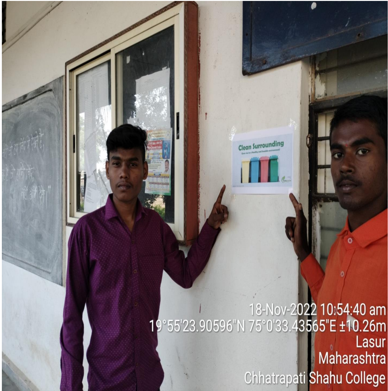
Clean surrounding Awareness Poster